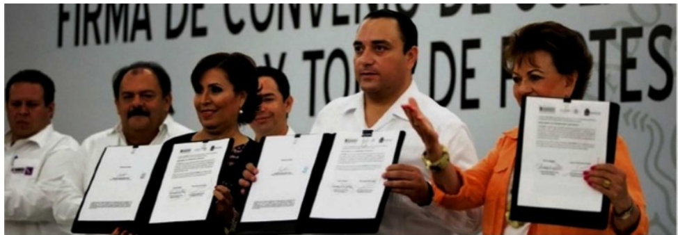
Gov. Roberto Borge (2-R) signed a cooperation agreement with Sedesol to boost anti-hunger programs.