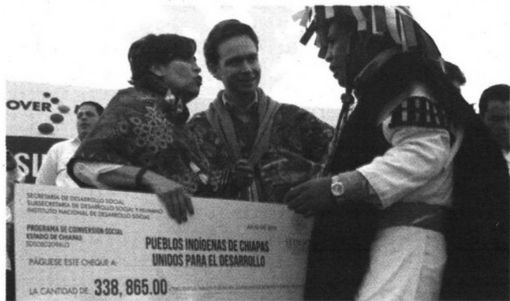
The National Crusade Against Hunger has benefited 97 municipalities.